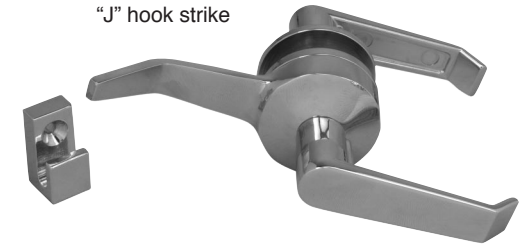
Fig. 0743 001 CHR 135° cam bar with "J" hook strike