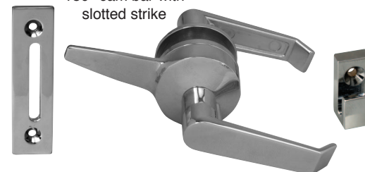
Fig. 0743 002 CHR 180° cam bar with slotted strike